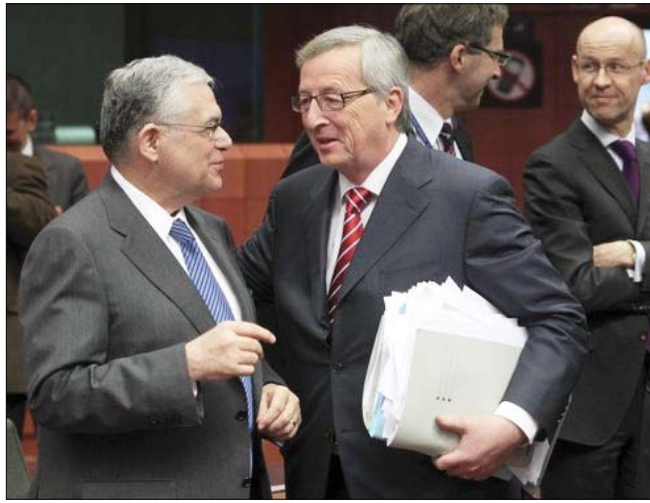
Greek Prime Minister Lucas Papademos, left, speaks with Luxembourg's Prime Minister Jean-Claude Juncker, center, during a round table meeting of eurozone finance ministers at the EU Council building in Brussels on Monday, Feb. 20, 2012.

According to analysts, Greece will continue to struggle with its economic woes even with the new 130-billion-euro (170 bil-