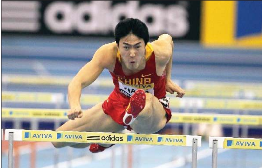
Liu Xiang of China crosses a hurdle during the men's 60m hurdles final at the Birmingham indoor tournament in Birmingham, Feb. 18, 2012. Liu Xiang wins the men's 60m hurdles final at the Birmingham indoor tournament on Saturday.

BEIJING-XINHUANET: China's Liu Xiang began his new season and Olympic year by beating arch-rival Dayron Robles of Cuba to win the men's 60-meter hurdles final at the Birmingham Indoor Grand Prix. Liu, the Athens Olympic champion ran a new personal best time