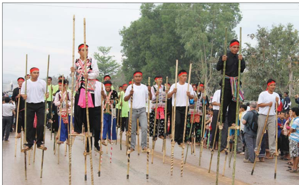
Colorful performance by Sayaboury residents as part of celebrating Elephant Festival 2012. Feb 18, 2012.