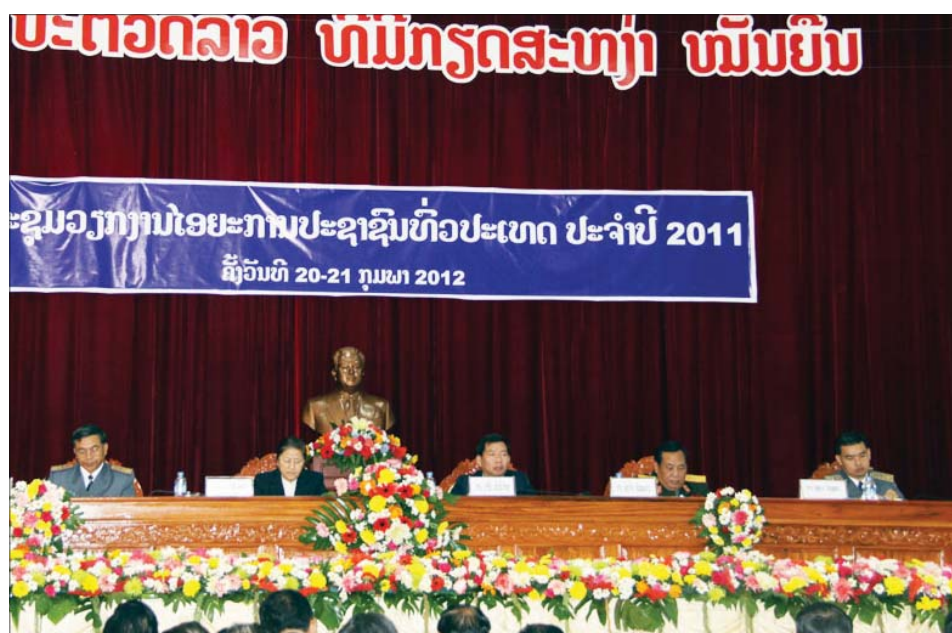
NA President Pany Yathortou present at the nationwide meeting on Public Prosecutors General Office 2011. Vientiane, Feb 21, 2012.