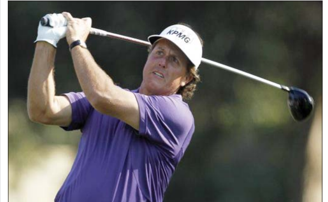
Phil Mickelson of the U.S. tees off on the second hole during the third round of the Northern Trust Open golf tournament at Riviera Country Club in Los Angeles.

The Riviera Country Club in Pacific Palisades, California is the venue for this year's Northern Trust Open with the left hander, Phil Mickelson clinging on to the prospect of another victory.