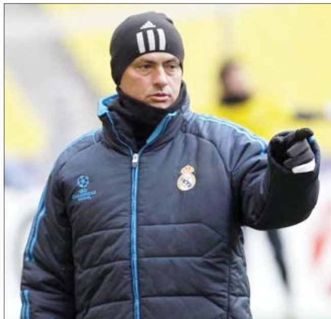
Jose Mourinho: Madrid has to be strong to overcome the adverse conditions in Moscow.

would count on his experience of CSKA from his time as Inter Milan manager in 2010, when Inter beat CSKA 2-0 on aggregate in the quarterfinals.