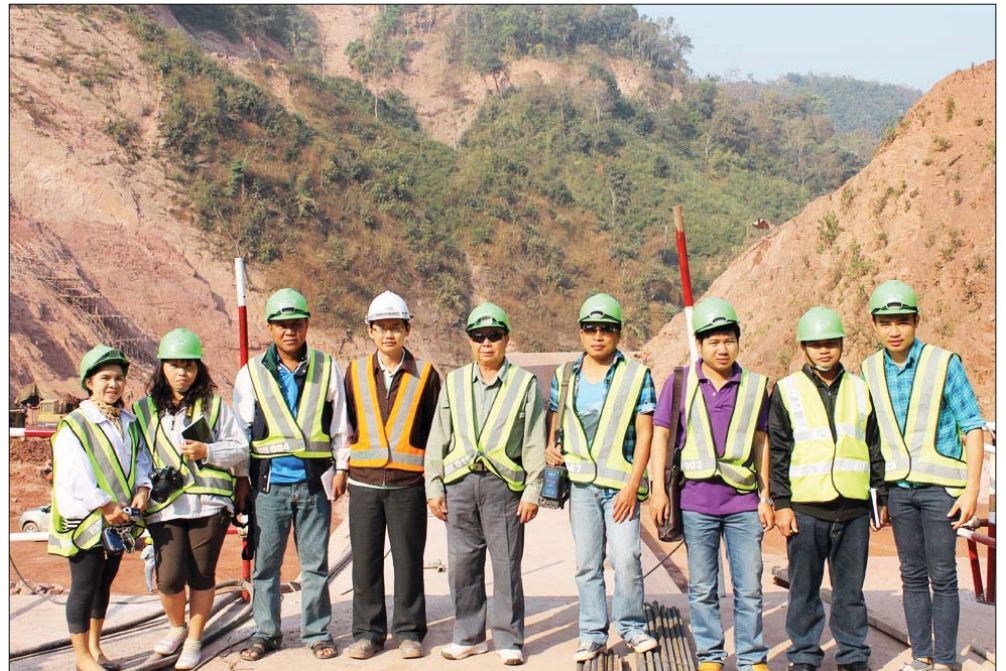
Print and broadcast media journalists on their field visit at the Nam Luok dam, subsidiary hydropower project of the 1878-MW Hongsa Mine Mouth Power Project in Sayaboury province. Feb 16, 2012