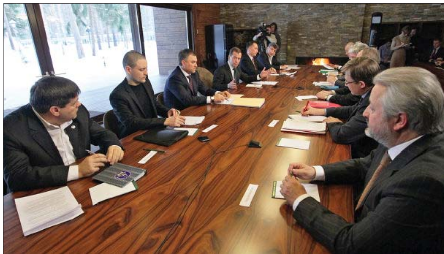
Dmitry Medvedev meets with the leaders of several unregistered parties