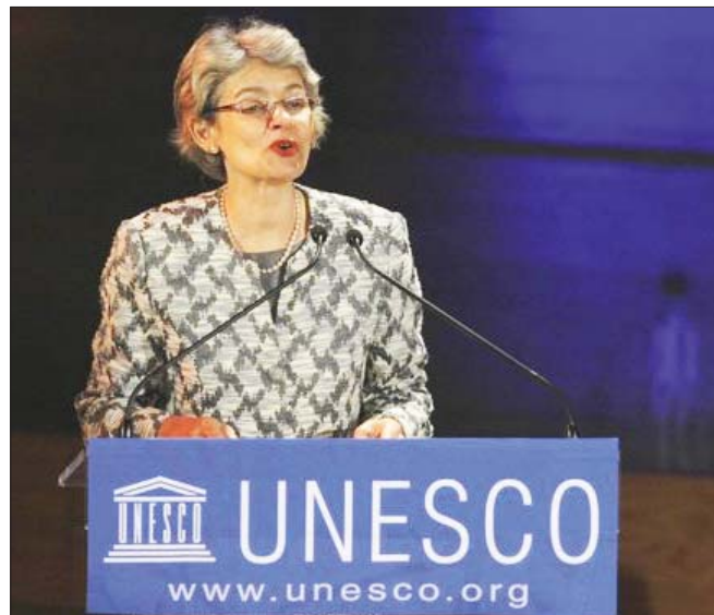
UNESCO Director General Irina Bokova