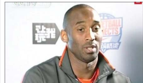
LA Lakers megastar Kobe Bryant has shared his views on the recent Jeremy Lin phenomenon.

LA Lakers megastar Kobe Bryant has shared his views on the recent Jeremy Lin phenomenon. Bryant compared China's Yi Jianlian, who is yet to make his impact in the NBA, with Jeremy Lin, who has gone from zero to hero in weeks. Kobe says opportunity counts in the building of a successful career.