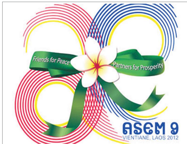
ASEM 9 logo

(KPL/VOV) - Relevant Vietnamese agencies will do their best to assist Laos to organize the 9th Asia-Europe Meeting (ASEM-9) scheduled to take place in Vientiane on November 5-6 this year.