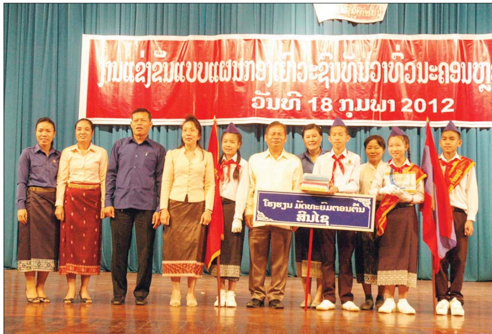
Sinsay Lower Secondary School as winner of Thanva Juvenile Contest at the National Cultural Hall in Vientiane, Feb 18, 2012