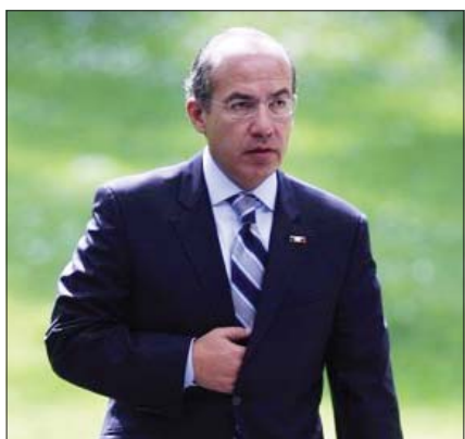
Mexican President Felipe Calderon.

According to the President, strengthening the international financial institutions, food security and sus-